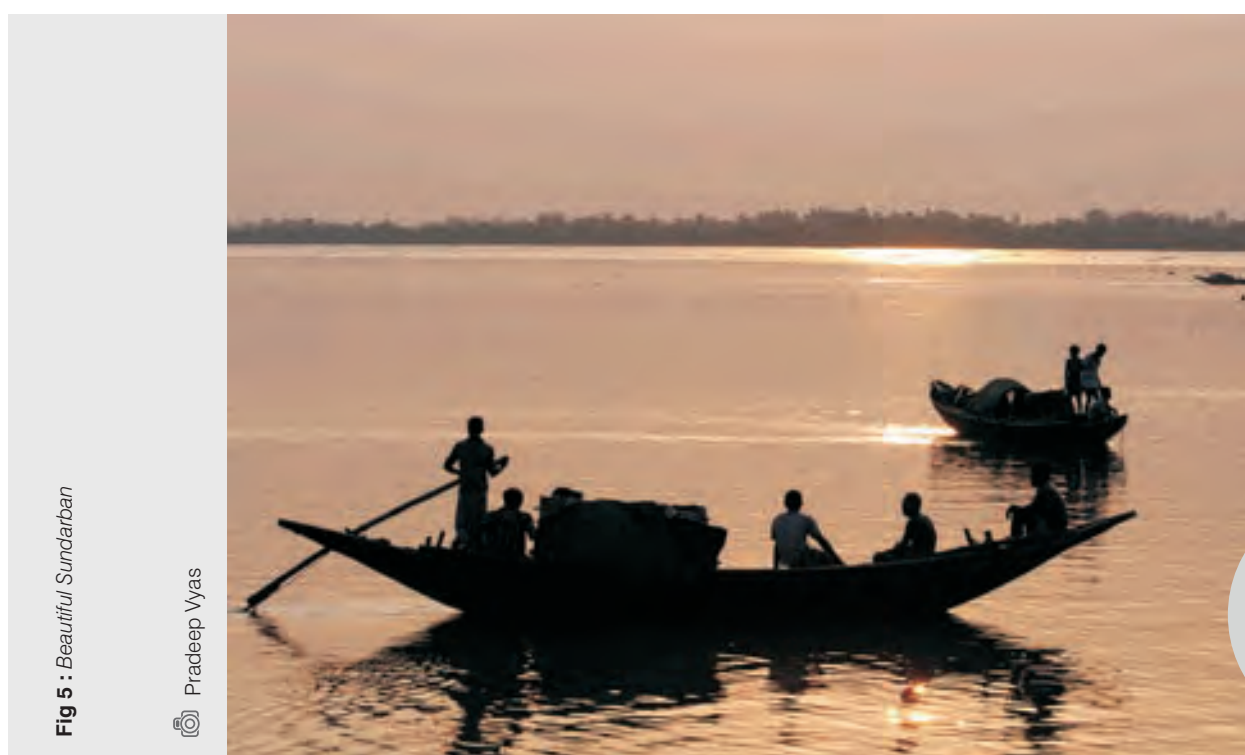
Fig 5 : Beautiful Sundarban

Increased industrialization of the areas around Kolkata contributes significantly to the pollution load in the estuaries and causes degradation of the Sundarban mangroves (Gopal & Chauhan 2006). Agricultural pollutants such as organochlorine pesticides and nutrient-rich inorganic fertilizers have deteriorated the geochemistry of the estuarine waters (Sarkar et al 2004). The estuary also receives about 400 tons of untreated municipal sewage and domestic waste from the Kolkata municipal areas and Howrah every year. Further, the population residing around the Sundarban disposes of waste in an unregulated manner (Saha et al 2006). The effects of this pollution have started to manifest themselves in the organisms inhabiting the estuaries. Chromium accumulation was reported from bivalves, along with increased selenium and zinc in fishes (Saha et al 2006). Oil exploration off the coast of the Sundarban is also regarded as a threat to the Sundarban ecosystem (Saha et al 2005).