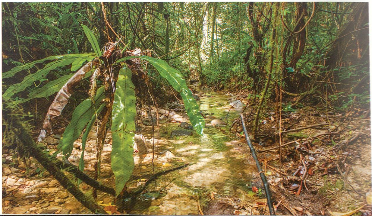
Stream in a rain forest in Great Nicobar island

individuals/ha in the Andaman Islands, and 210 \pm 190 individuals/ha in the Nicobar Islands. Frogs occurred at low abundance in many small islands, but this could be an artifact of the sampling period mostly covering post-monsoon and dry seasons. There is a large variation in abundance among quadrats, indicating the possibility of patchy or clustered distribution of individuals (Table 3). Therefore, the