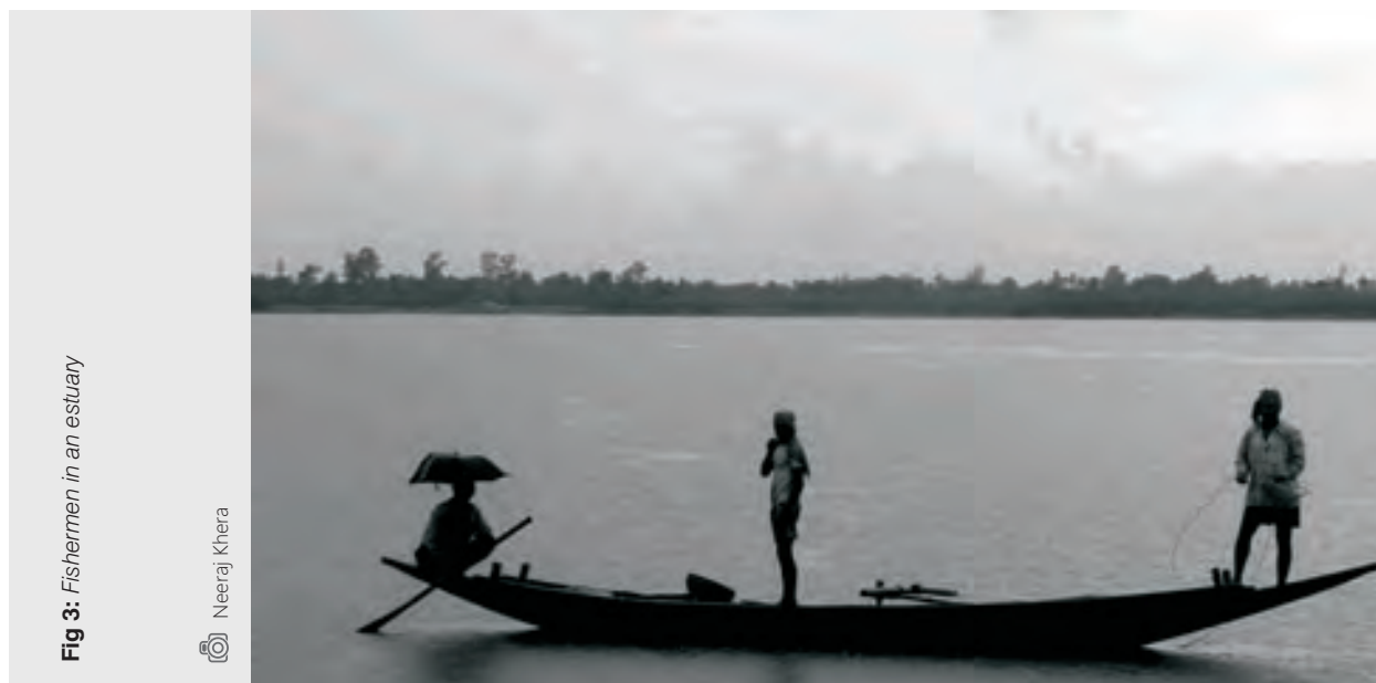
Fig 3: Fishermen in an estuary