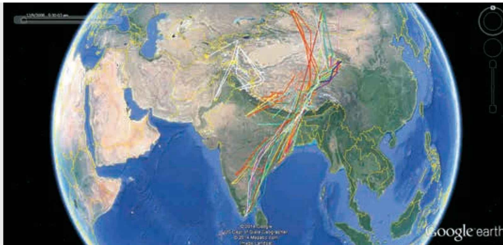
Figure 2 : Various Bar-headed Goose migration-based studies conducted in Asia (Source: Javed et al. 2000; Koppen et al. 2010; Kallra et al. 2011; USGS http://www.werc.usgs.gov/ )

greatest movement of the BHG recorded is 3,000 km (Takekawa et al. 2009; Hawkes et al. 2013), whilst in China the least movement was as little as 17.89 km (Cui et al. 2011). Recent advances in tracking techniques include GPS-based PTTs, which are far more precise and reliable than ARGOS-based PTTs (Tanferna et al. 2012). Although valuable information on migration has been obtained, the available literature confirms that the studies have been affected by technical failures of the transmitters (Hawkes et al. 2013). Thus sufficiently large sample sizes are recommended for telemetry studies. However, funding could be a limiting factor for developing countries such as India.