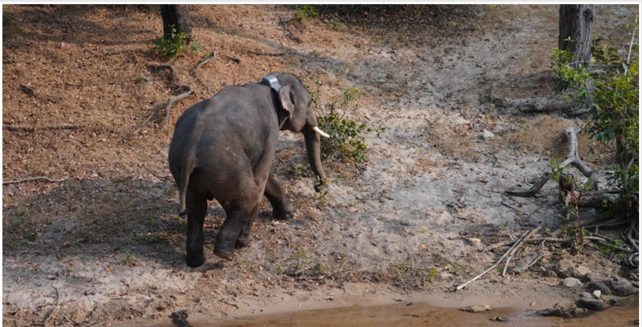
Elephant equipped with a GPS/VHF collar on 20th November 2024