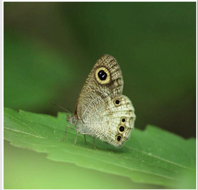
Ypthima huebneri , the Common Four Ring, has small eye spots on the fringes of its wings.

Later that day, I read a paper on the reasons behind these differences and how seasonal polyphenisms are selected. The paper discussed the factors influencing seasonal polyphenism in tropical butterflies. One intriguing detail I hadn't known before was that many butterflies use cues such as photoperiod, humidity, and temperature during the larval stage to determine which morph the larva will metamorphose into. Key differences between the wet season form (WSF) and the dry season form (DSF) of a particular butterfly species include eye spots, cryptic colouration on the underside, and wing shape. In the wet season form, spots are conspicuous and the colours and patterns are not particularly cryptic. In fact they can even appear aposematic in some instances. Conversely, the dry season form displays reduced or absent spots, more cryptic patterns on the underside and wing shapes that often mimic leaves to maximize camouflage.