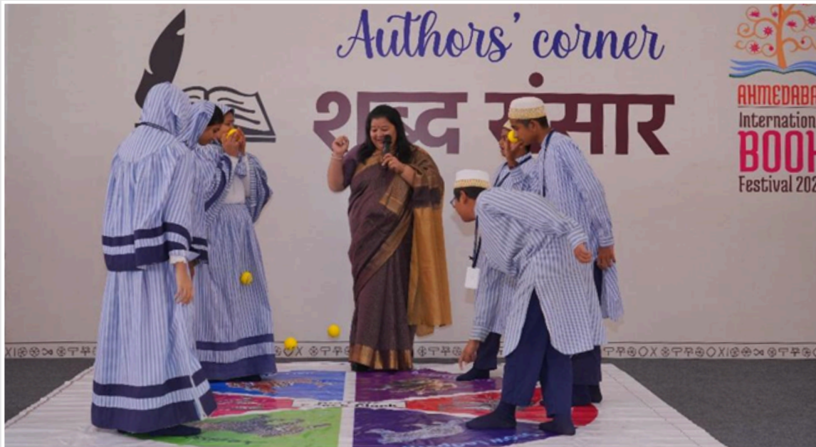
Children engaging in Big Cats Knock-Clock activity