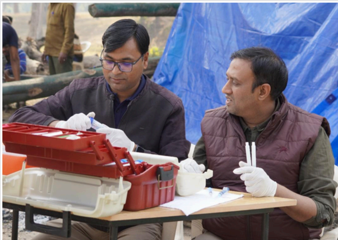
Drug preparation for immobilisation

The resurgence of elephants in Madhya Pradesh is not merely an ecological event; it is a testament to the resilience of nature and the power of human ingenuity in wildlife conservation. As these megaherbivores are re-occupying their ancestral habitats, they symbolize conservation anticipation, balance, and the enduring bond between humans and elephants. By safeguarding elephants, we ensure the health of entire ecosystems, benefiting not only wildlife but also future generations of humans.