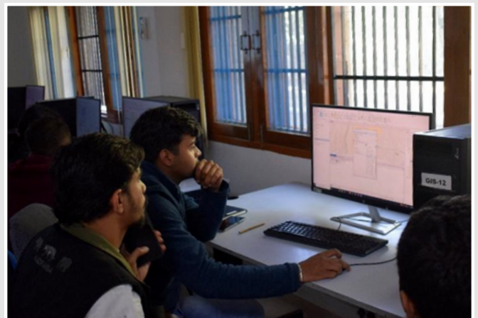
Five different hands-on sessions were conducted during the GIS Day Workshop