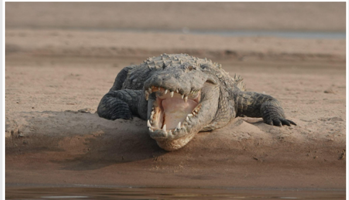
A closer look at the gaping behaviour of Muggers

A regularly observed behaviour exhibited by muggers and other member species of Crocodylia is when they keep their mouths wide open for prolonged periods while basking during the day. This behaviour is called “gaping”. It is primarily associated with thermoregulation as crocodiles sweat through their mouths and this behaviour is considered as a basic way to cool down. They also have a symbiotic relationship with birds. When their mouth is left open, some species of birds feed on the debris between their teeth, cleaning and removing parasites from the muggers’ mouths. We were fortunate to witness this behaviour firsthand during our orientation tour in Chambal.