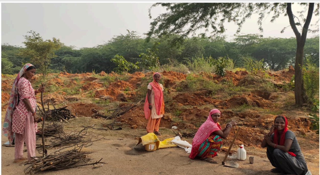
A group of women collecting firewood from the sanctuary.