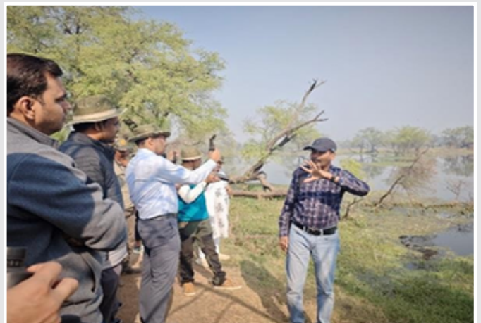
Field session at Keoladeo National Park