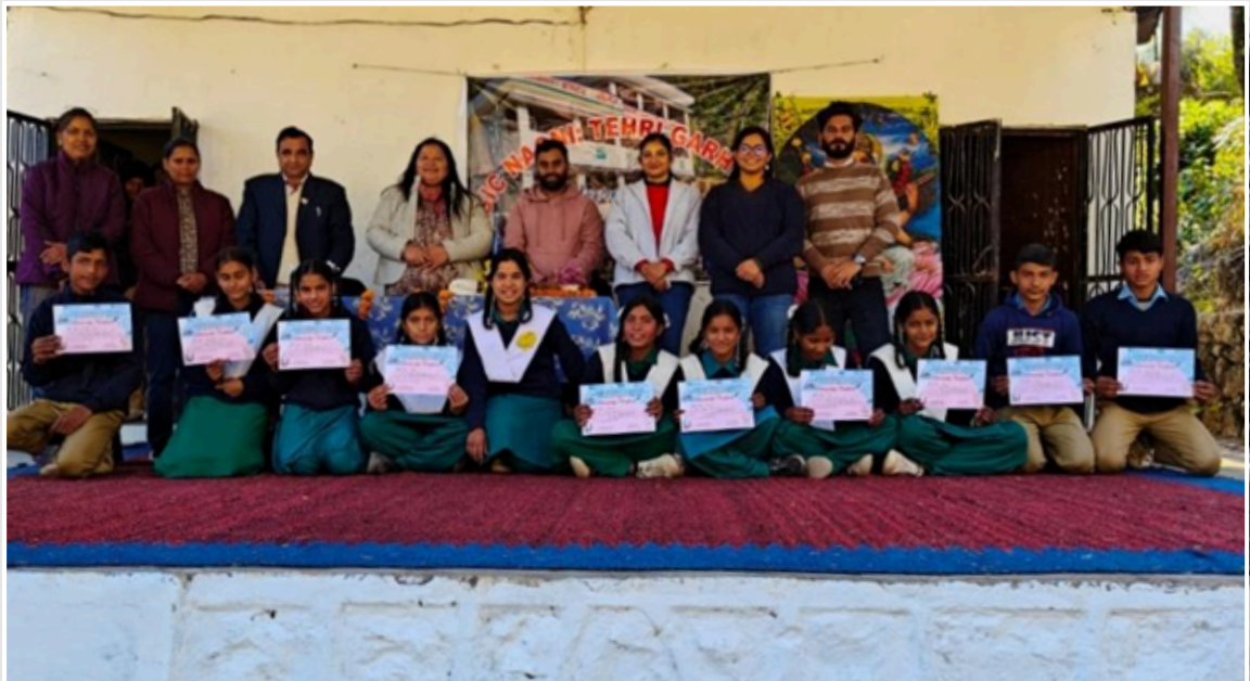
Students receiving Bal Ganga Prahari scholarship Award