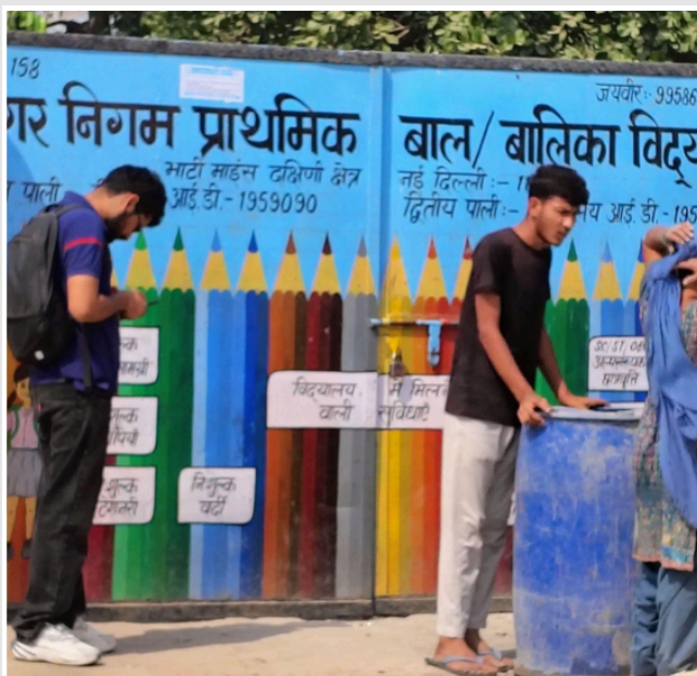
Government School in Bhatti village

8. Healthcare Deficiencies: The village lacks adequate healthcare facilities and infrastructure, further exacerbating hardships, particularly from monkey-related injuries.