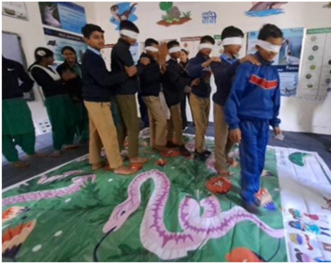
Students involved in team building exercise