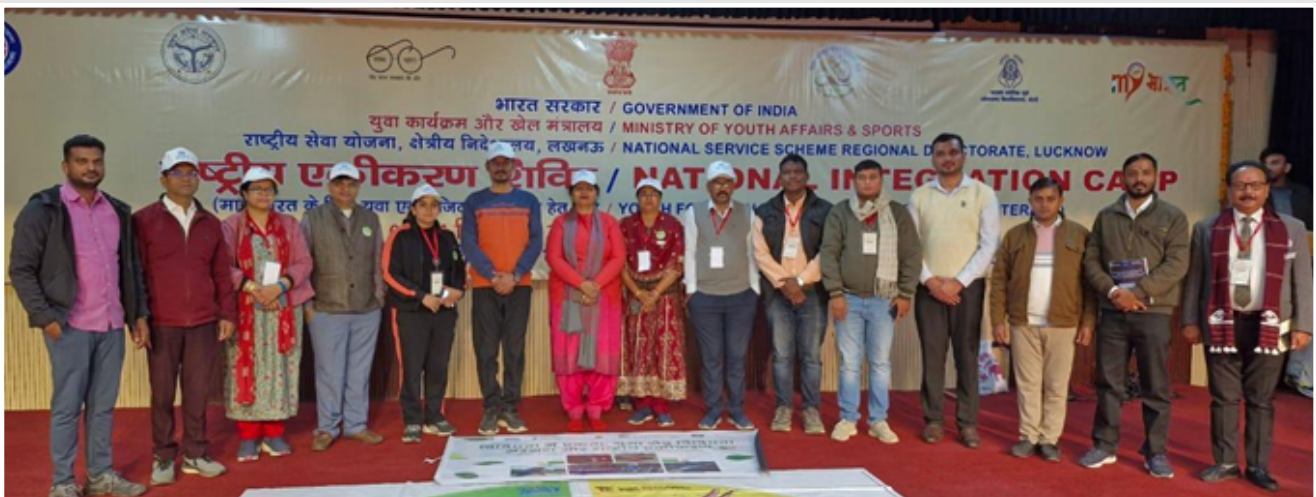
Group picture of WII-NMCG team with NSS Programme Officers

Speaking at the event, the WII-NMCG team stressed the need to integrate biodiversity conservation into daily practices and called upon the youth to act as ambassadors of change. The workshop successfully instilled a sense of responsibility among NSS volunteers to safeguard rivers, ensuring the long-term health of India's aquatic ecosystems. It demonstrated the power of collective action and highlighted the indispensable role of youths in shaping a sustainable future for freshwater river conservation.