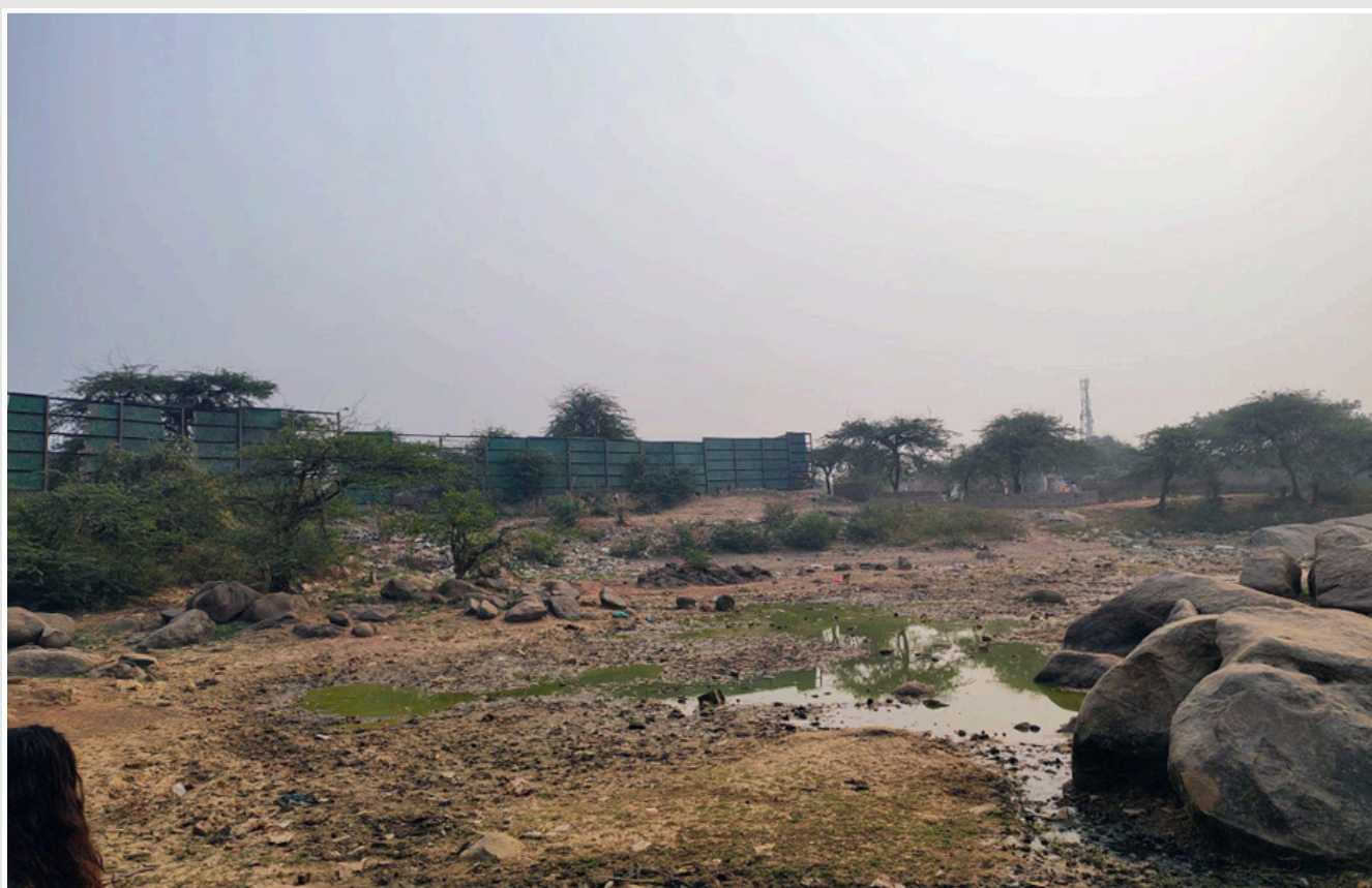
Untreated drainage water flowing into the sanctuary, a pressing environmental concern

7. Macaque: Conflict with monkeys is a serious issue, with injuries and property damage affecting every household.