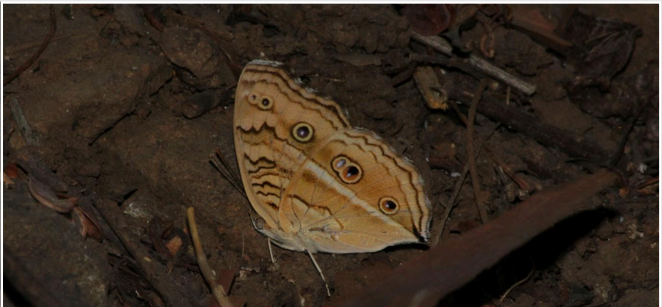
Peacock Pansy , Wet Season Form.

The dry season form has no spots on the underside but features a line running through the centre and pointed wings to mimic a leaf.