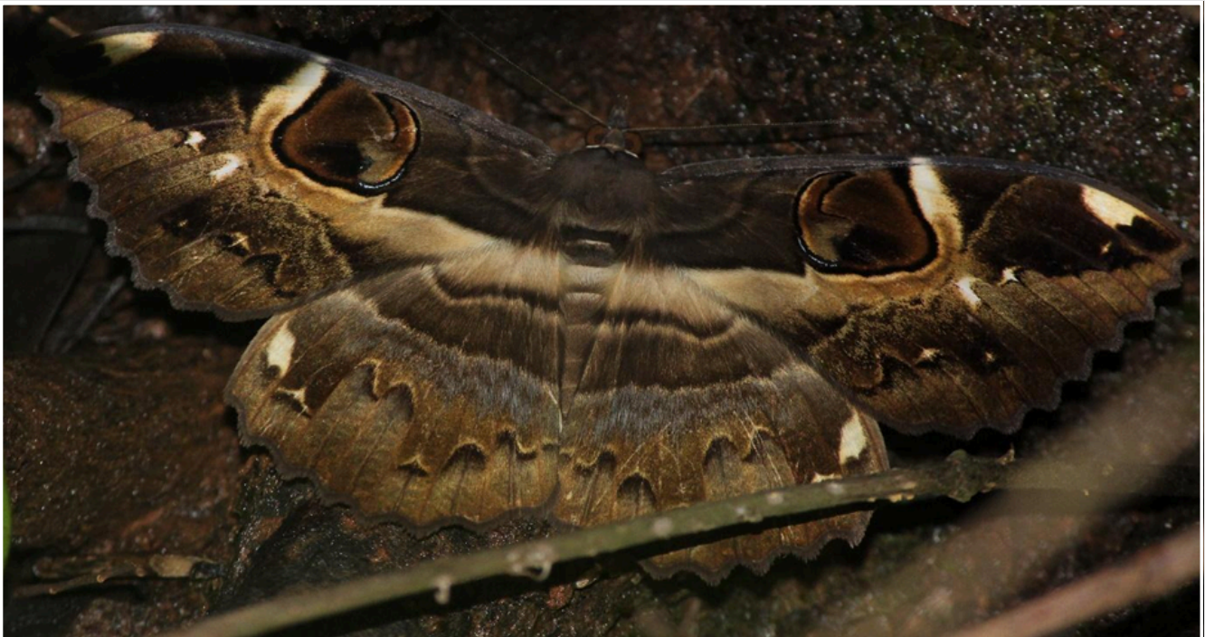
Erebus ephesperis has large eye spots to deter predators