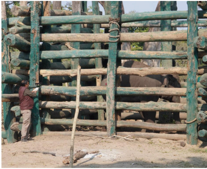
Administering drugs to immobilise the elephant