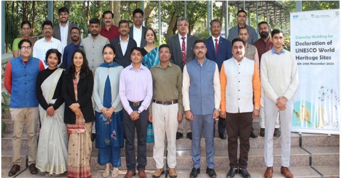
Participants of the Capacity Building programme with WII Faculties and staff