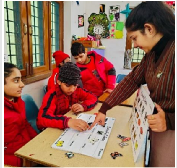
Students identifying butterflies