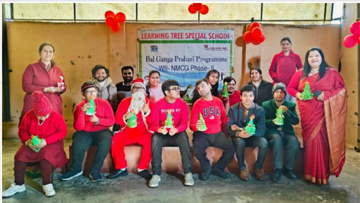
Group photograph with the special students