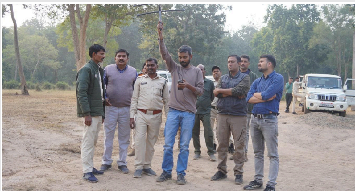
Checking the radio-collar frequency and its VHF range of collared elephant