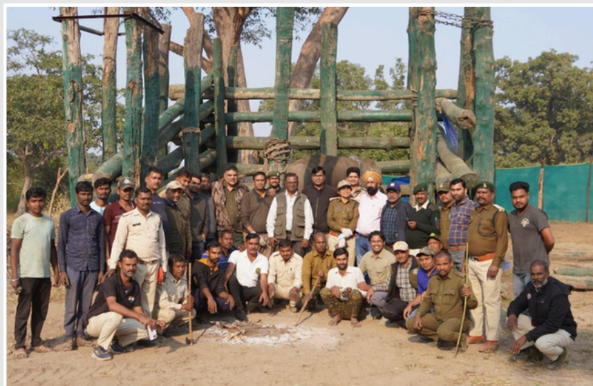
Group photograph of the team