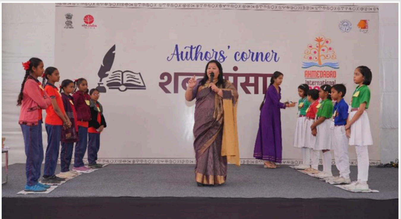
Children engaged in collaborative team-building exercise

The event culminated in an exciting finale with the activity 'Big Cats Knock Clock'. Participants collaborated to identify and answer questions about the six big cat species, exploring their physical traits, habitats, and distribution. The children's enthusiasm and teamwork were truly remarkable as they showcased their knowledge and competitive spirit with great energy.