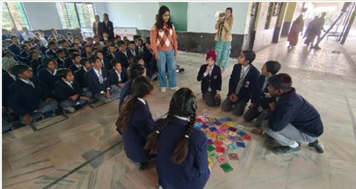
Interactive sessions on Life in Ganga

The students who demonstrated exceptional creativity and innovation were recognized and awarded prizes for their efforts. This sensitization program was a valuable initiative, highlighting the power of education and engagement in tackling environmental challenges, and reinforcing the need for collective action to protect our natural heritage.