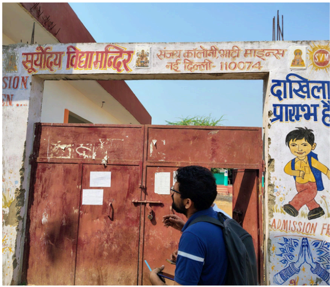
Government School in Bhatti village