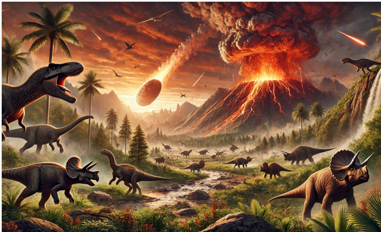
An AI generated image showing the hypothetical scenario of an asteroid hitting the Earth while a volcano erupts in the background

Nicolaus Copernicus's idea that the Sun is the centre of the solar system, Charles Darwin's idea of evolution via natural selection, Ignaz Semmelweis's idea of hand sanitation to reduce infections, and Alfred Wegener's idea of continental drift, are common knowledge today. Still, these revolutionary scientific ideas did not gain wide acceptance when they were first proposed. This is true for most ground-breaking scientific ideas. An exception to this would be Luis W. Alvarez's Asteroid impact hypothesis in 1980 which became an instant hit among the masses. However, some in the scientific community have reservations about it to date.