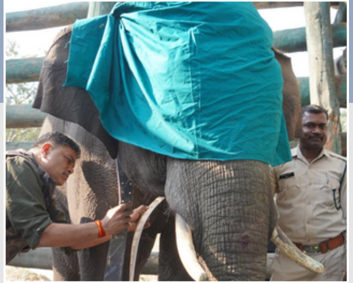
Blind folding and collaring the elephant