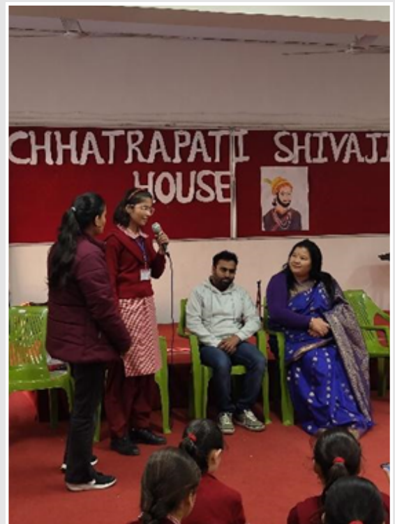
Engaging lessons with 3D models, sound recordings, and interactive sessions for waste segregation