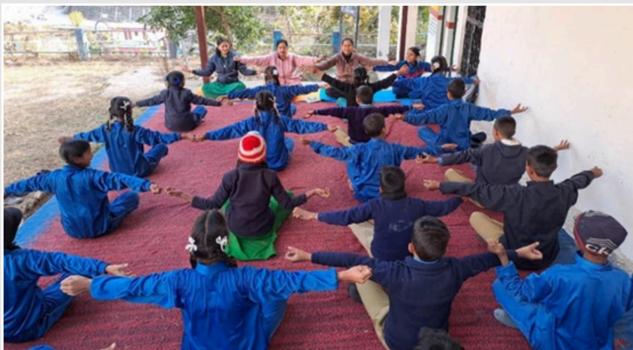
Yoga session with Students