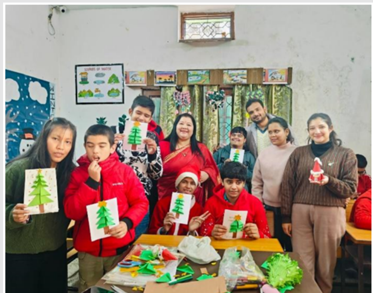
Students showcasing their creativity with Art and Craft of Christmas Tree