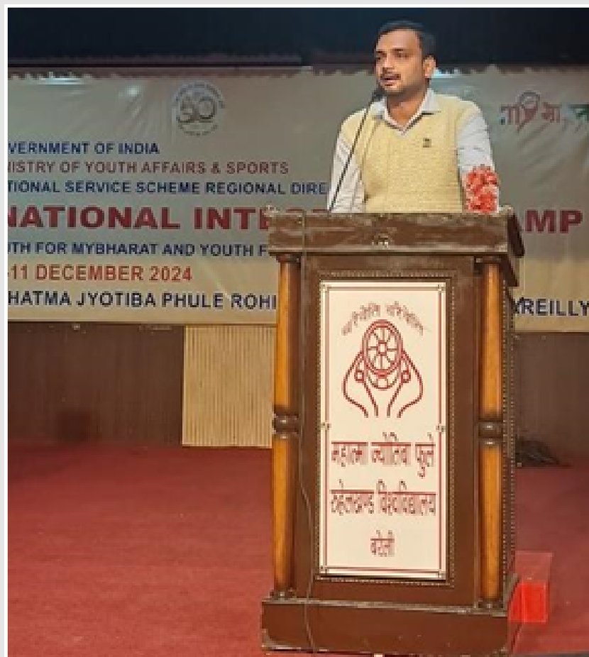
WII-NMCG team member interacting with the participants