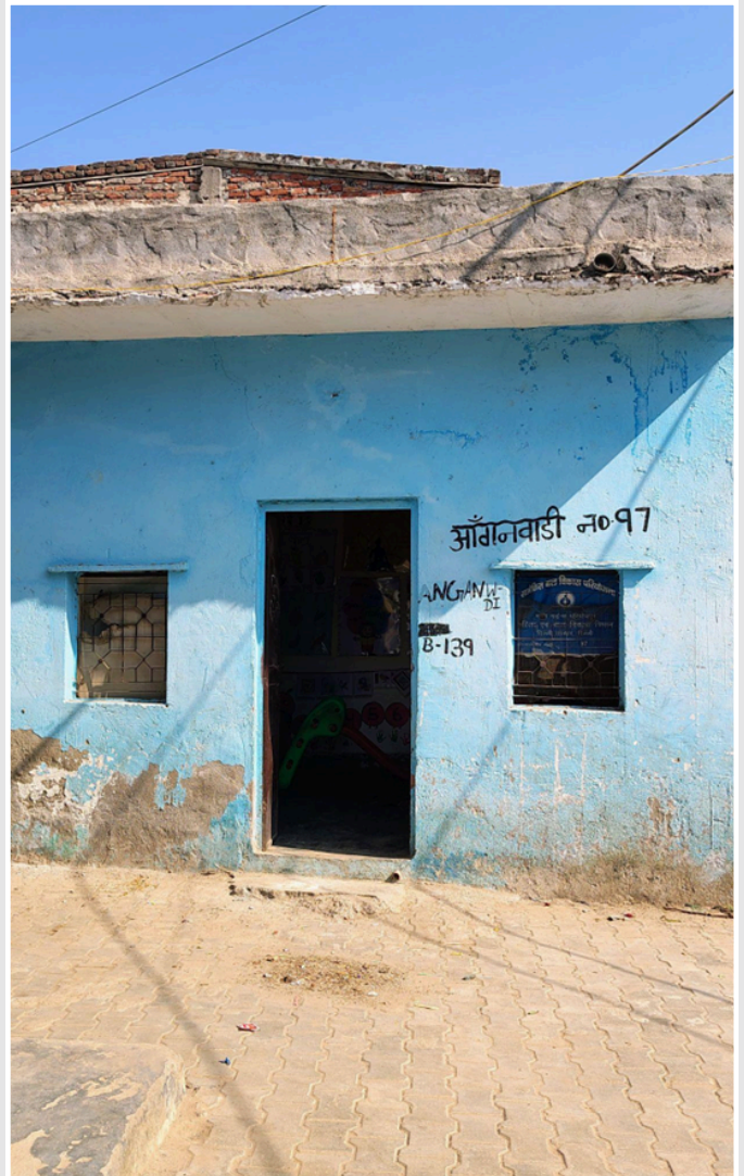
Anganwadi in Bhatti village