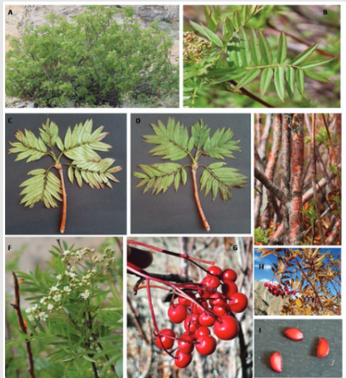
Figure 2. Diagnostic features of S. tianschanica : A – Habit; B – Leaves; C&D – dorsal and ventral sides of leaves; E – Stem and bark; F – Flowers; G&H – fruits (Berries); I – Seeds.

2. A new distribution record of Sorbus tianschanica (Rosaceae) from a remote valley in the high-altitude cold desert of Ladakh by the WII team. The authors suggest further research work on species such as the S. tianschanica that are present at the margin of their distribution range or as relicts in small environmental pockets.