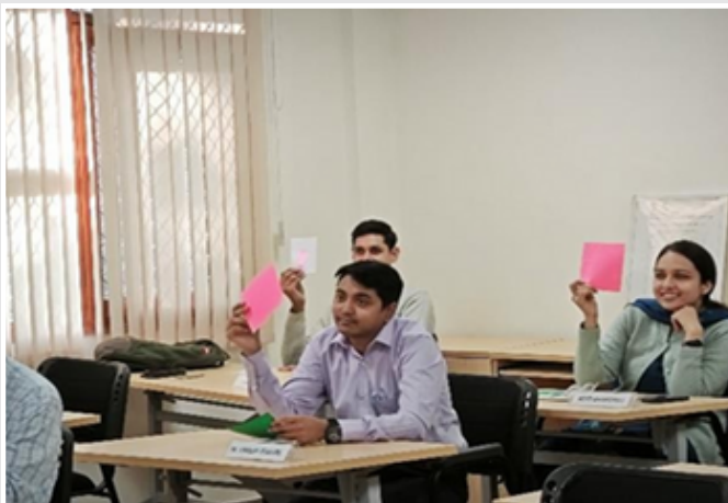
Participants during a lecture session