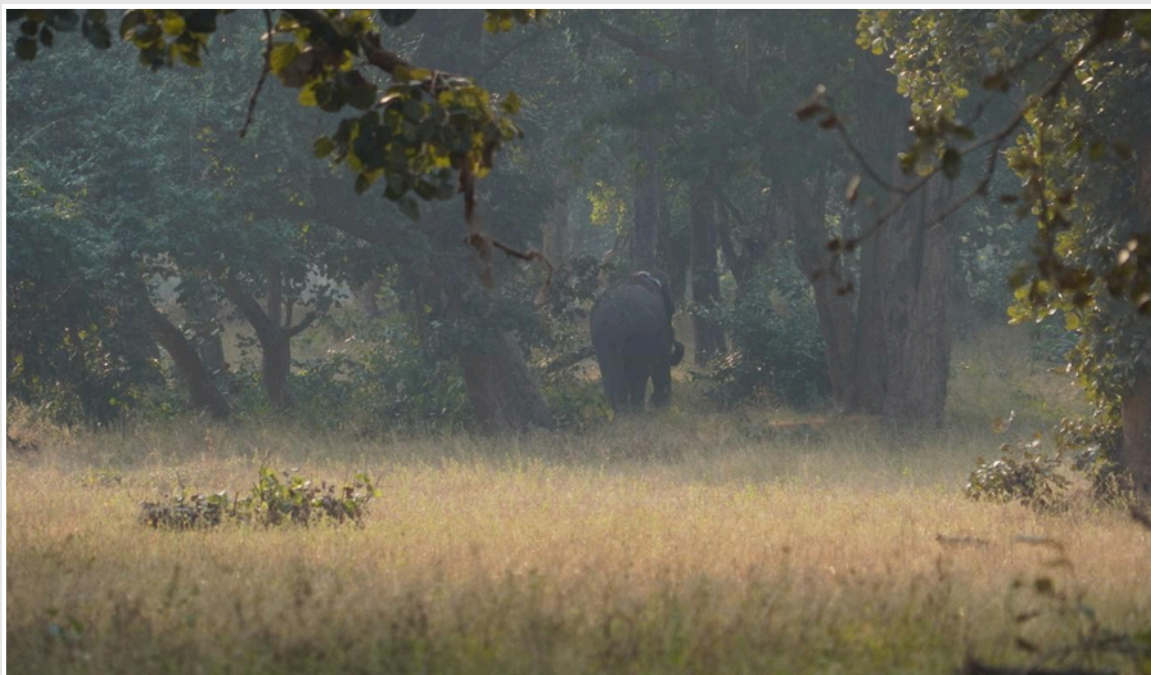
Elephant equipped with a GPS/VHF collar on 9th December 2024