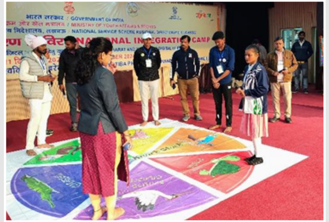
NSS Volunteers playing Wildlife Knock-Clock