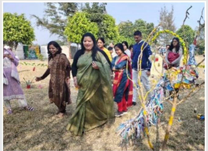
Biodiversity Park made by Recycled Plastics